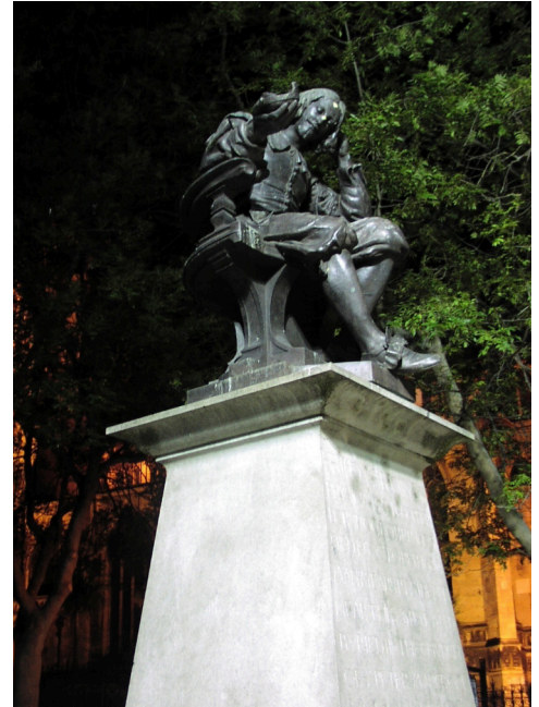
Hay Hill, Henry Pegram statue 1905

In the summer of 2023, a series of book benches appeared in Norwich, celebrating 5 historic and 60 contemporary writers, including Julian of Norwich and Anna Sewell. Some are stone stacks and some take different sculptural forms. Though we are happy for the chosen writers, sadly, Thomas Browne was not amongst them this time round. However, there is one set of stone benches yet to be inscribed so the Thomas Browne Society is embarking on a mission to rectify this by raising some funding to pay for the stonemason artist to return to Norwich and inscribe one for Thomas Browne, though we also have to persuade Norwich BID who commissioned them. See https://www.visitnorwich.co.uk/book-benches/