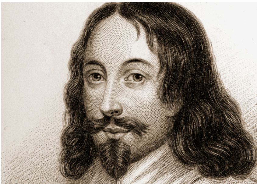
Portrait of Thomas Browne who had a tendency to blush!