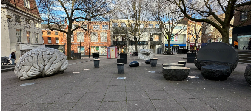
Hay Hill, April 2023