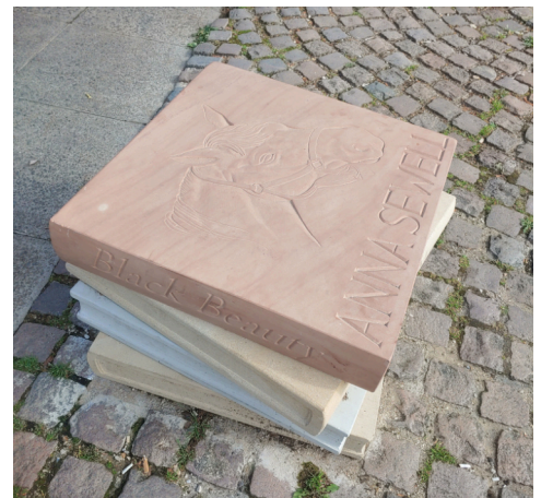
Book bench stack outside St Giles Church, Norwich dedicated to Anna Sewell