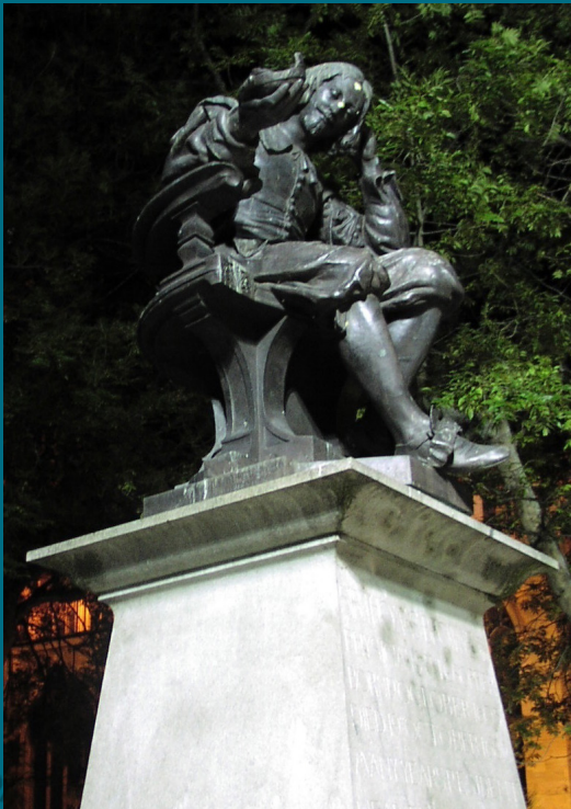
Sir Thomas Browne on Hay Hill

Sir Thomas Browne was a 17th century physician and polymath who lived in Norwich for most of his adult life, in the Hay Hill area of the city. He died aged 77 on his birthday in 1682, on 19 October which is now Sir Thomas Browne Day.